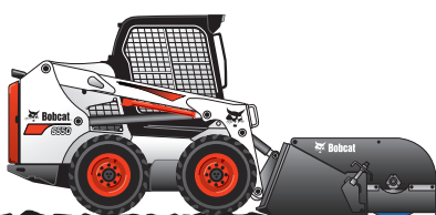
Sweeps and collects traveling in reverse