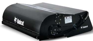
Sweeper: No special requirement.